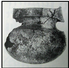
Highly decorated pot from dig at Roebuck